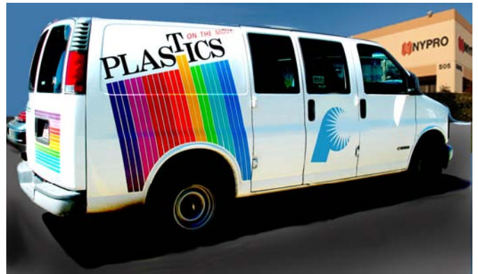
Above: San Diego PlastiVan™

The Outreach Department is happy to report the newest base of operation in San Diego, California. As part of the National Plastics Center's "Campaign for Education", the outreach department has expanded the educational reach of the PlastiVan™ program to serve the plastics community in the western portion of North America. The West Coast operation is supported by Nypro, Inc. and Nypro San Diego will serve as a home base for the PlastiVan™. Since the inception of the PlastiVan™ program, the NPC's outreach team has educated over 500,000 students across North America. As an introduction to the west coast, the PlastiVan™ is scheduled to visit all eighth grade classes in San Diego. The PlastiVan™ will be visiting many communities in the western and southwestern portion of the United States. ~ Marjorie Weiner