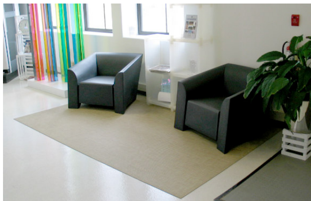
Above: Chilewich Plynyl™ Floormat, and Heller roto molded MB chairs in NPC lobby

Our sincere thanks to the following donors for their gifts of time, materials equipment, and supplies: